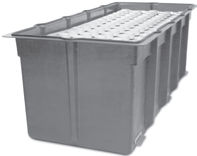
The heart of the AdvanTex ® AX20 Treatment System is this sturdy, watertight fiberglass basin filled with an engineered textile material.

For sizing, see "AdvanTex ® Design Criteria," NDA-ATX-2.